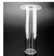
Chamber Well Insert: Item #7300-2004