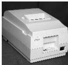
Epson Roll Printer: Item #5430-0058