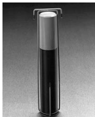
CAP-MAC-S Molly Assay Canister for Syringes: Item #5130-2046