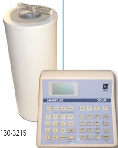
CRC ® -25R Dose Calibrator: Item #5130-3215

Innovative designs, proven performance and the most comprehensive technical system available is what you would expect from the leader in dose calibrator design and development! For the premium service, Count on Capintec for our long-standing commitment to customer satisfaction and support.