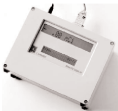
CRC-AD25 Auxiliary Display: Item #5130-2224