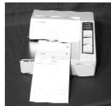
Epson Ticket Printer: Item #5430-0100